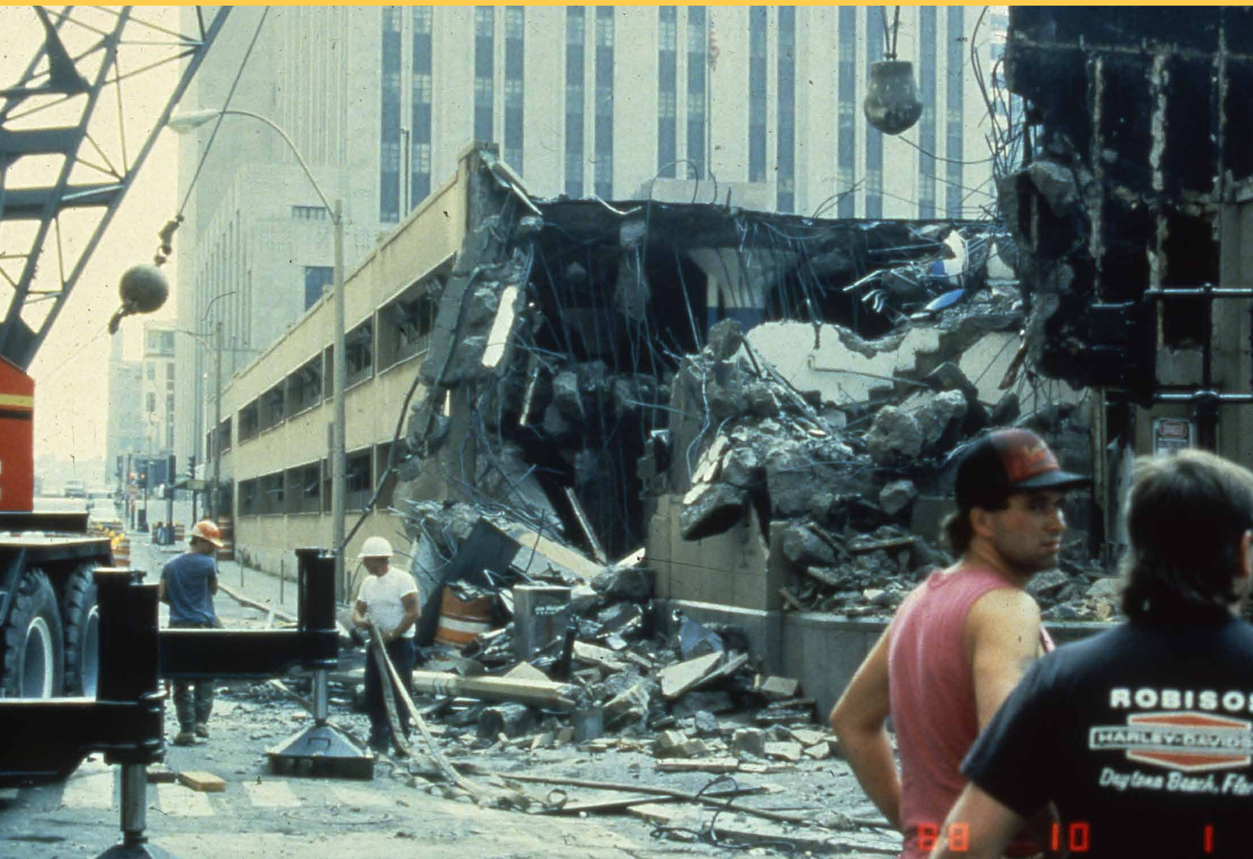
October 1, 1988 – And the walls came tumbling down...